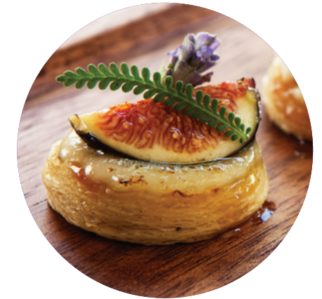
Groom's room day of ceremony for the men to get ready in, stocked with premium drinks and gourmet bites.