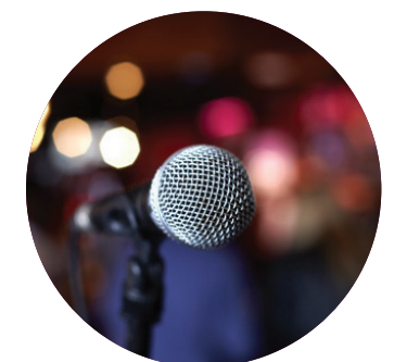
Sound System with Microphone.