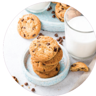
Cookies and Milk turn down service for kids, delivered daily or nightly.