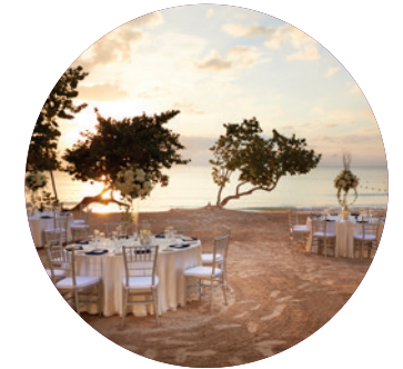
Private Beach Reception Location.