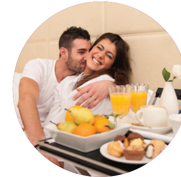
Gourmet Honeymoon Breakfast in Bed.