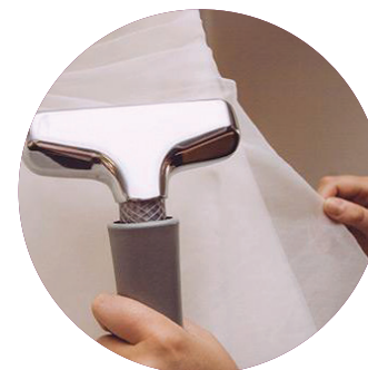
Attire attendant that assists with the wedding garments when needed 2 .