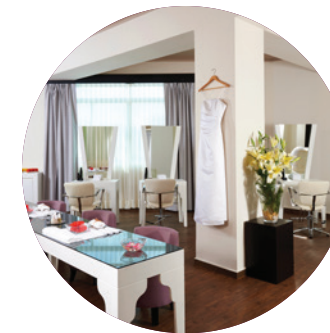
Bridal spa suite day of ceremony for the women to get ready in, stocked with Mimosas and gourmet bites.