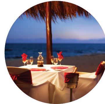
Private Candlelit Dinner on the Beach.

and we will send you off in the right direction with these luxury honeymoon inclusions: