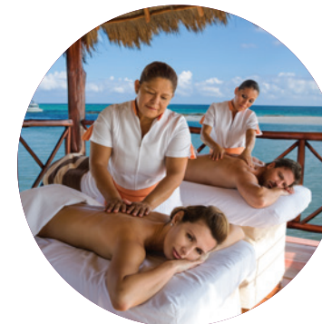
2 for 1 Sky Massage.