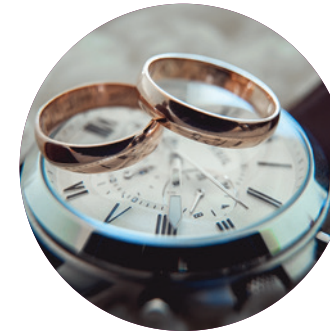
Guaranteed Wedding Ceremony Time.