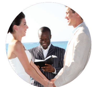
Non-Denominational Minister or Judge and Symbolic Wedding Certificate 4 .