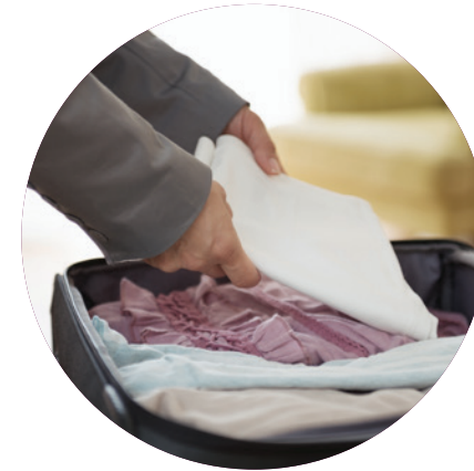
Packing and unpacking services.