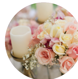
Ceremony Decór 6 .