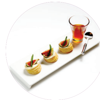
Nightly turn down service for the wedding couple.