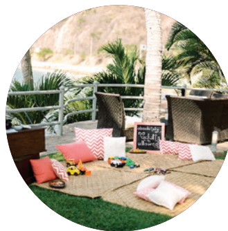
Kids Only lounge at the reception, which is a designated, staffed area near the reception with fun things for the kids to do.