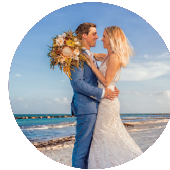
Only Wedding On Site During Your Stay.

Have the destination wedding of your dreams with these Exclusively You ceremony inclusions: