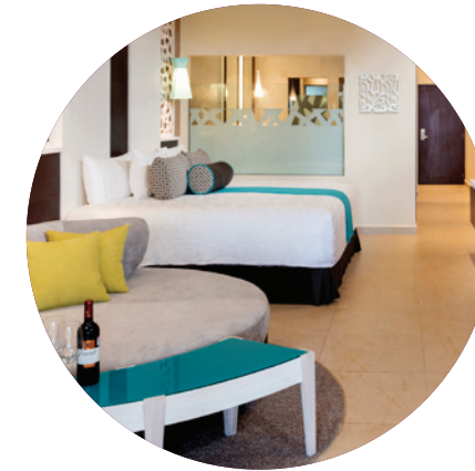
Groom's room to stay in the night before the wedding (pending availability).