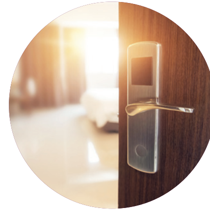
Private in-suite check in.

Experience these elevated services and amenities for the Exclusively You couple: