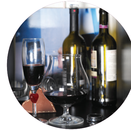
In-suite bar stocked to your personal preference.