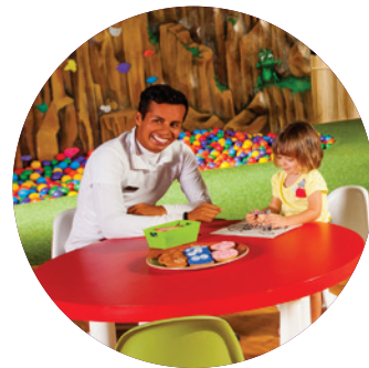
Kids activities specific to the wedding group including a Pastry Chef in Training activity and wedding themed Arts & Crafts.