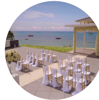
Guaranteed Premium Wedding Location.