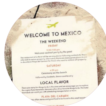
Personalized welcome letter and group itinerary.