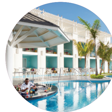
Pool or beach section reserved for the group daily with a personalized sign.