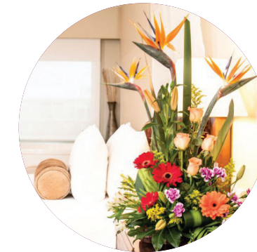
Fresh Tropical Flower Arrangement in Room.