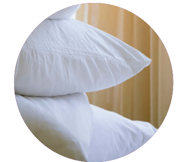
Premium pillow and aromatherapy selection.