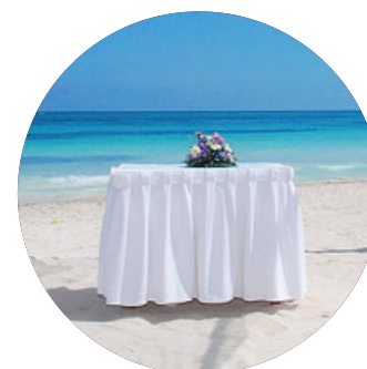
Altar Table & Aisle Runner.