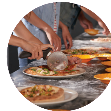
One group cooking class to enjoy together.