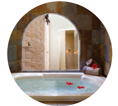
Romantically Decorated Suite.