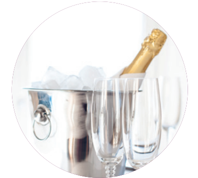
Chilled Bottle of Sparkling Wine In-Suite.