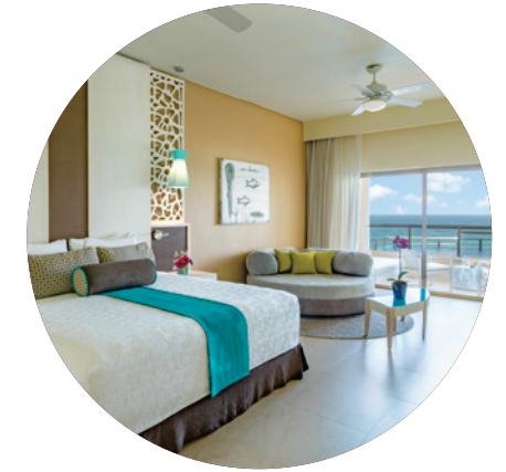
Free suite upgrade to the next category (pending availability).