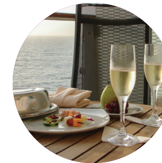
Sunset cocktails and gourmet bites delivered to the wedding couple's room daily.