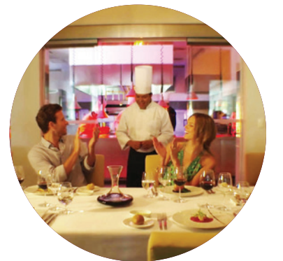
One semi-private group dinner reservation.