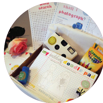
Kids Wedding Activity Pack, which includes items such as a Disposable Camera Kit, bubbles, a wedding themed coloring book, crayons, sand toys, and treats.