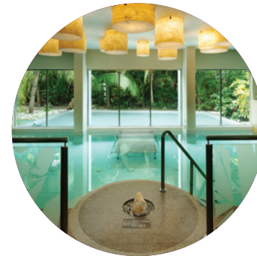
15% Off Spa Services.