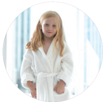
Kids' robe and slippers in room upon arrival.