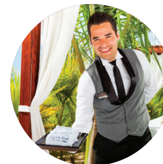
Cold towel service upon arrival to ceremony embroidered with wedding couple's initials and wedding date.