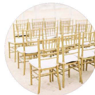
Gold or Silver Chairs 5 .