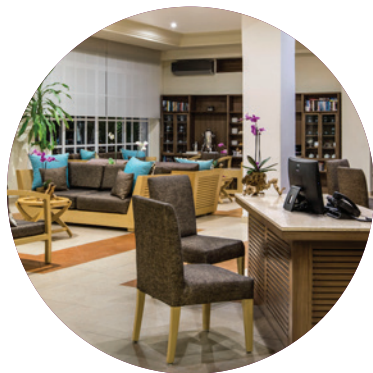
Private hotel check in for the group.